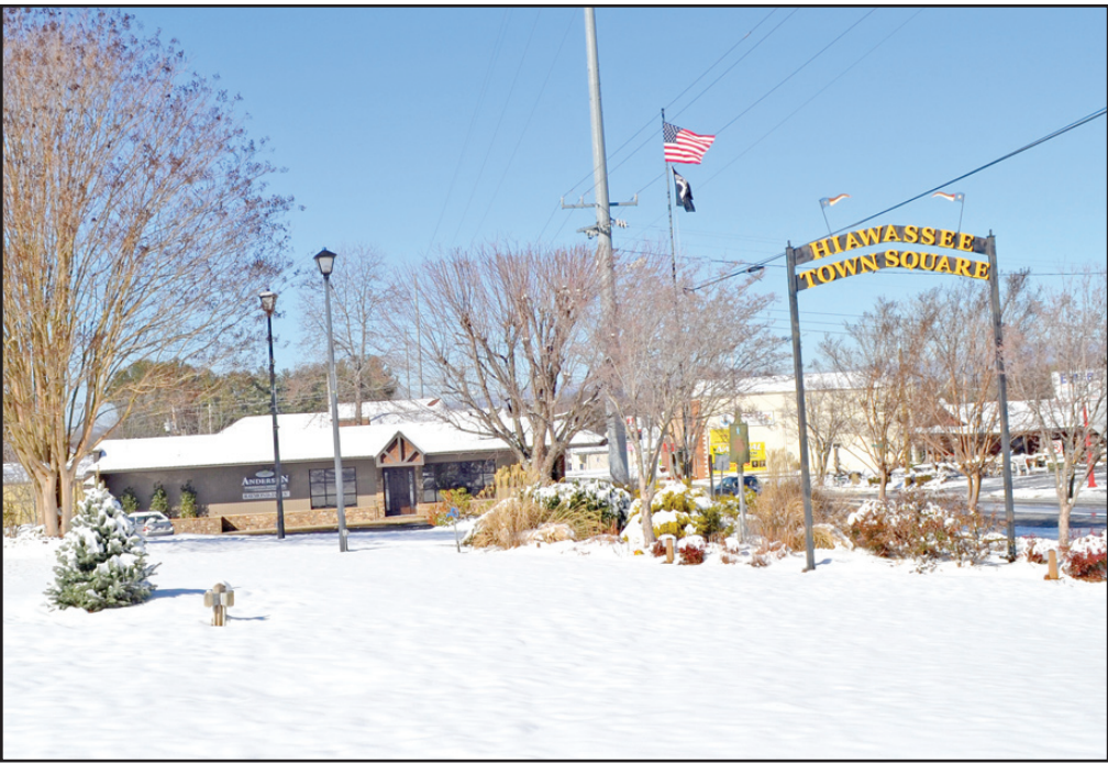
The Hiwassee Town Square covered in snow that fell Jan. 6 and Jan. 7.